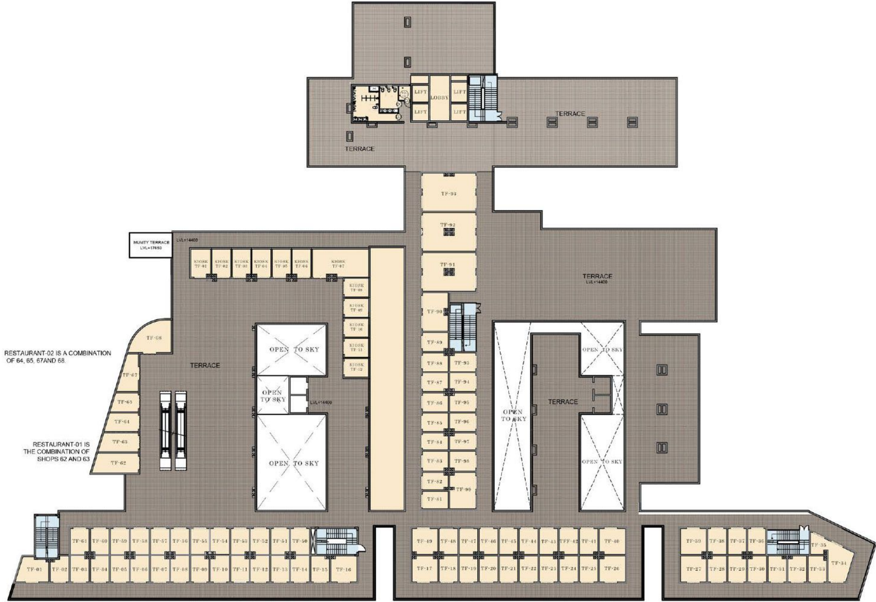
THIRD FLOOR PLAN (BLOCK A)